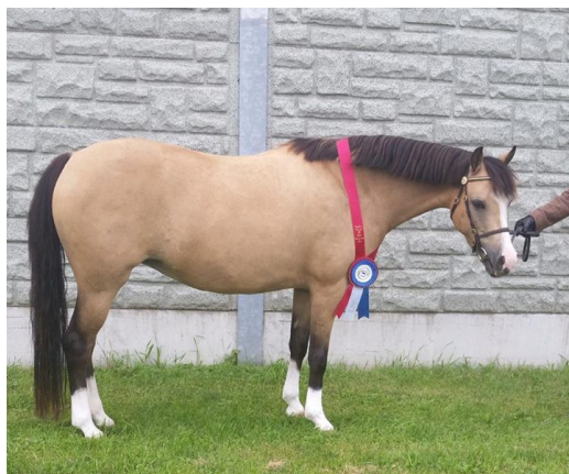
Farnley Roxanna and her stylish neck ribbon at the Canadian All Welsh at Orono.