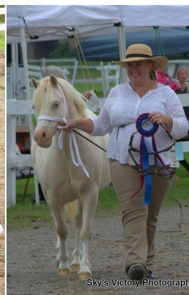
Bidwell Lady Guinevere, her first show was at the all welsh championships in Orono, winning champion A overall. At 19 years old, it's never to late to try showing!