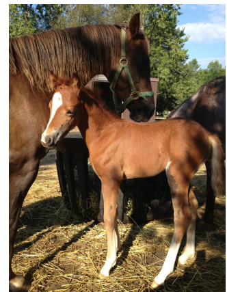
Better late than never! Wind Dancer Sonatina (Fydlyn Adlais x Downland Satinwood) was born in August this year!