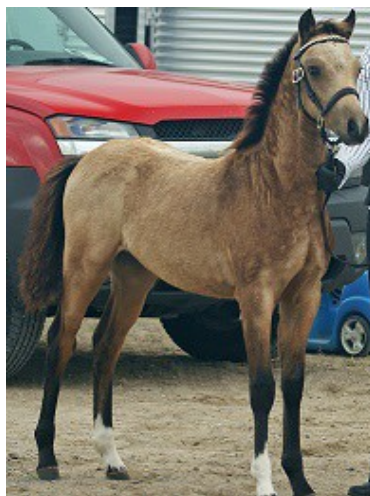
Gentle Breeze Final Edition by JMR Golden Phoenix & Cllynncopa Holliberri Section B Colt