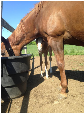
Generals Fydlyn Elegance with her dam at 2 weeks old.