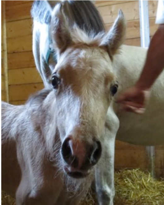
Wray Acres Ariel (Whispering Spring Melody x Beaverwoods Mystique)