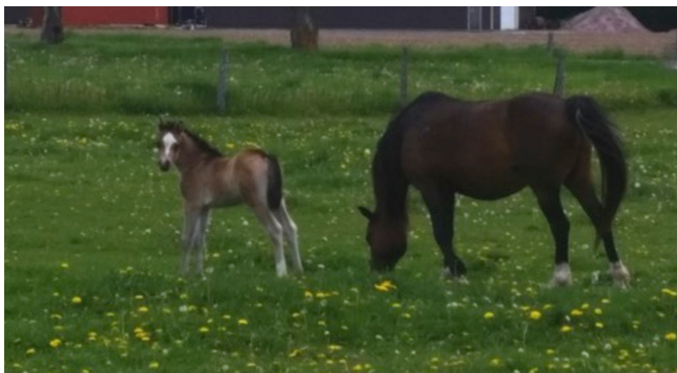
Reidell You Raise Me Up (Rollingwoods Raisin Ruckus x Northern Cross Briar Rose) Section B Buckskin filly Born May 17 th