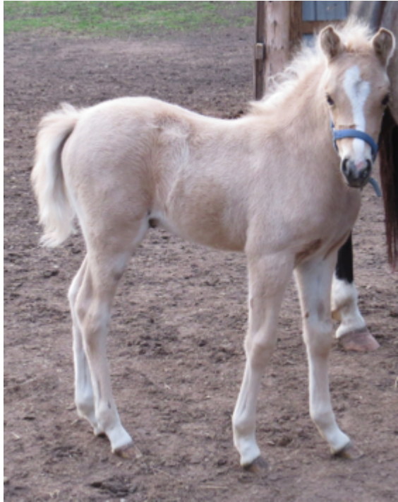
Wray Acres Golden Onyx ( Brenrey Lil Bit x Glanvrnwy Casper )