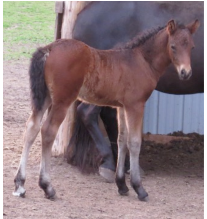
Wray Acres Electra ( Wind Dancer Elusive x Foxy )