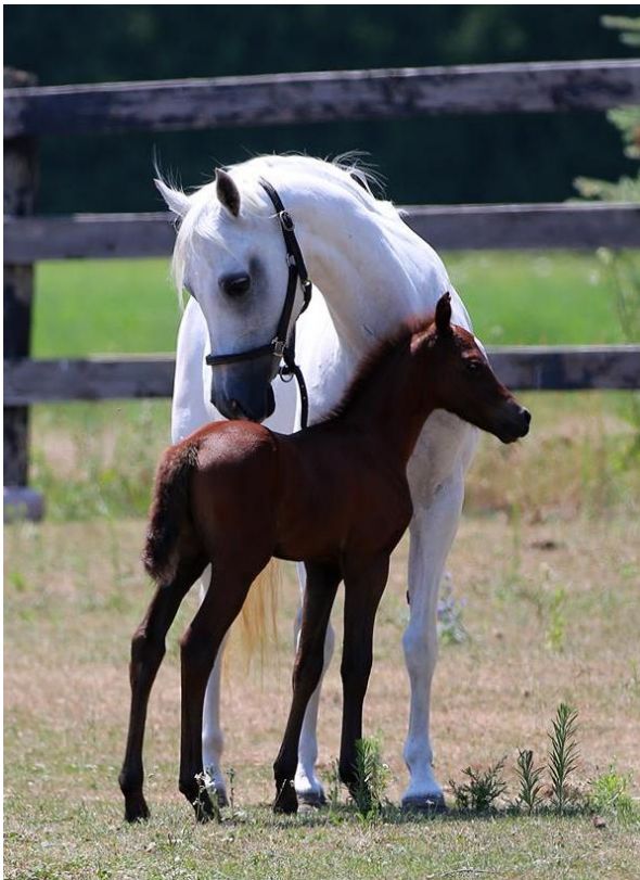
All photos courtesy of Alice McKeen